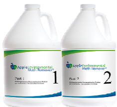
Apple Environmental Meth Remover