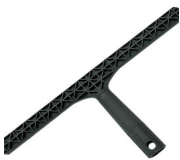
Plastic T-Bar 14"