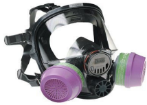
North full face respirator