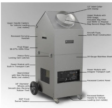
Duct Cleaning Equipment: Vacuum i.e. Hepa Aire 2500, compressor, and whips