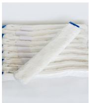
Scrubber pads 14"