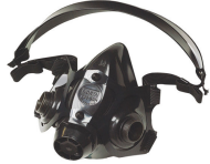
North half face respirator